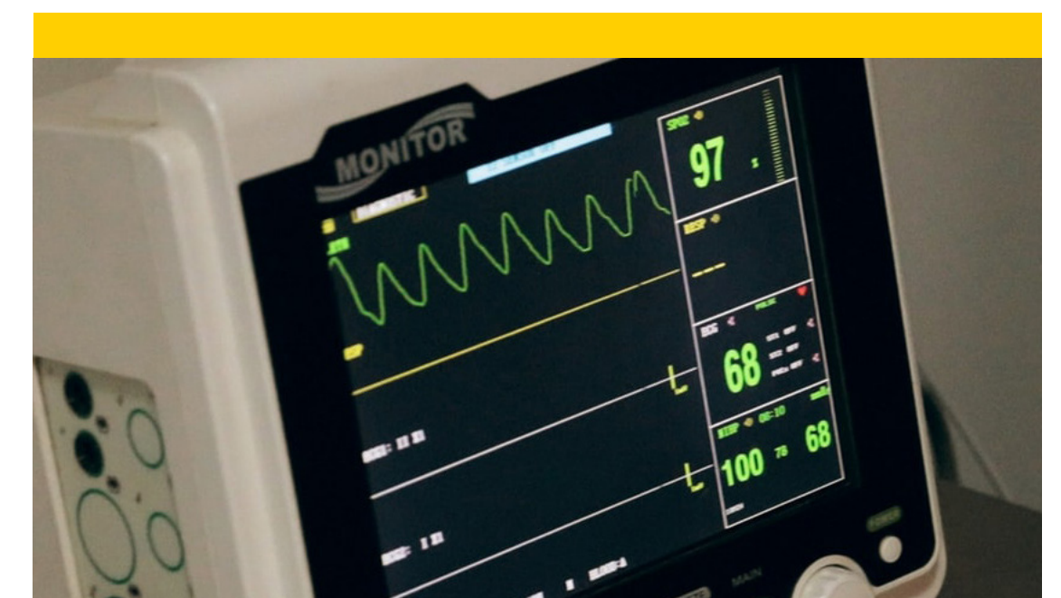
Medical Equipment Rental